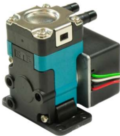
FF 20 DCB-4