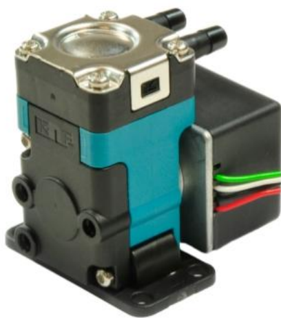
FF 12 DCB / DCB-4